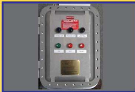
EX CONTROL PANELS