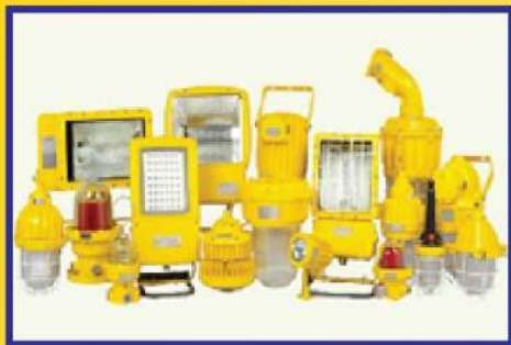
EX LIGHT FITTINGS