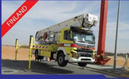
AERIAL PLATFORM FIRE FIGHTING VEHICLE