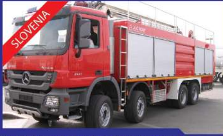
MULTI AGENT FIRE FIGHTING VEHICLE