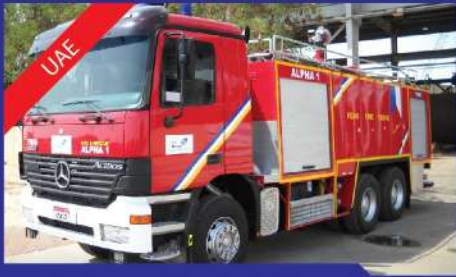
FULLY REFURBISHED FIRE VEHICLE