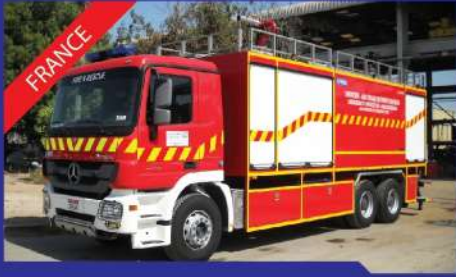
TRIPLE AGENT FIRE FIGHTING VEHICLE