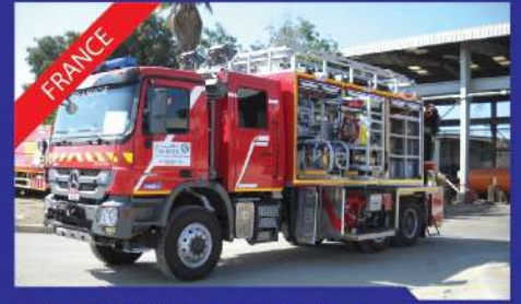
RESCUE EQUIPMENTS VEHICLE