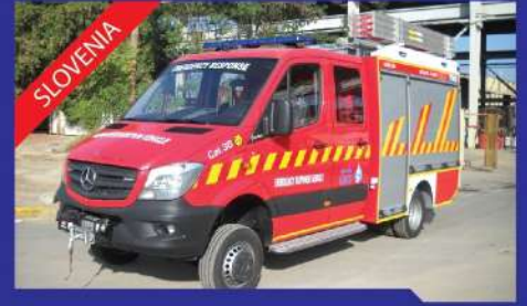
RAPID INTERVENTION VEHICLE