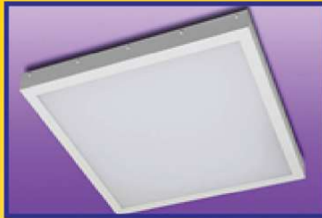
LED PANEL LIGHTING