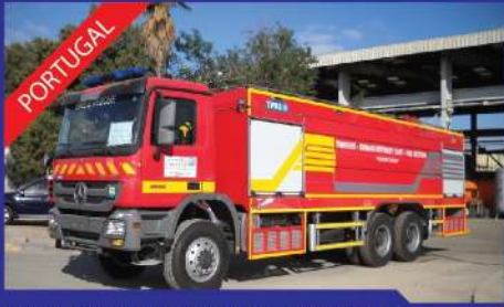
INDUSTRIAL FIRE FIGHTING VEHICLE