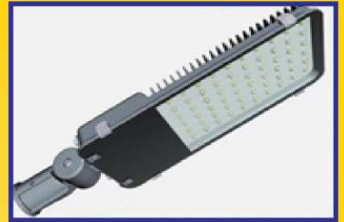
LED STREET LIGHTING