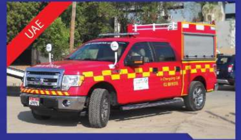
QUICK INTERVENTION VEHICLE