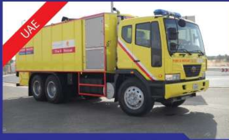
HOSE LAYING & RETRIEVING VEHICLE